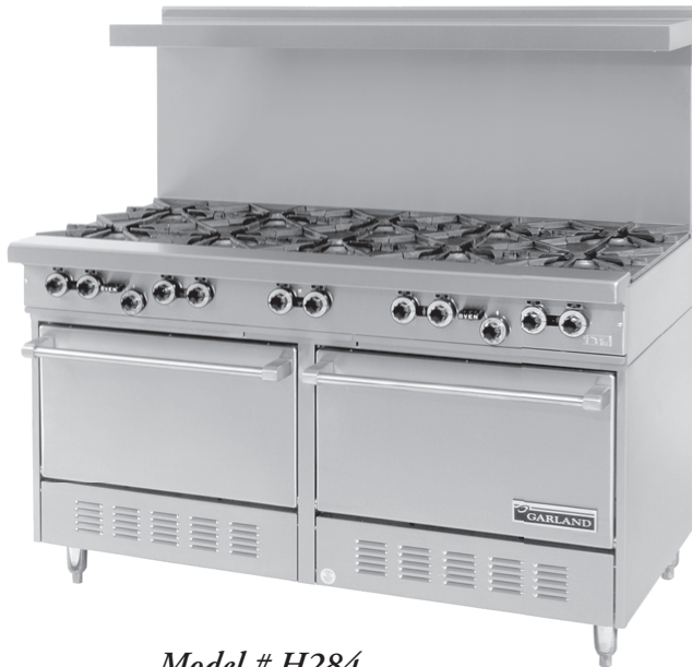
Model # H284

Product Name: 60" Starfire Series Medium Duty Gas Range